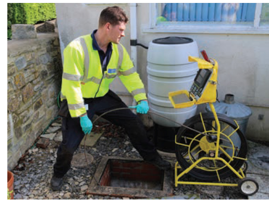
Carrying out a CCTV survey